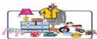
Table Sale Produce Market