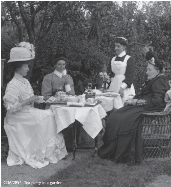
G36/289/1 Tea party in a garden