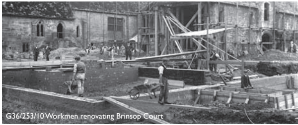
G36/253/10 Workmen renovating Brinsop Court